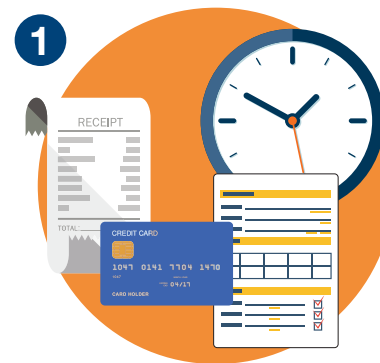
Import checks and Time & Attendance data