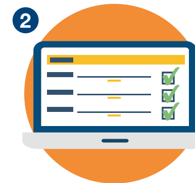
Approve pooled gratuity reports