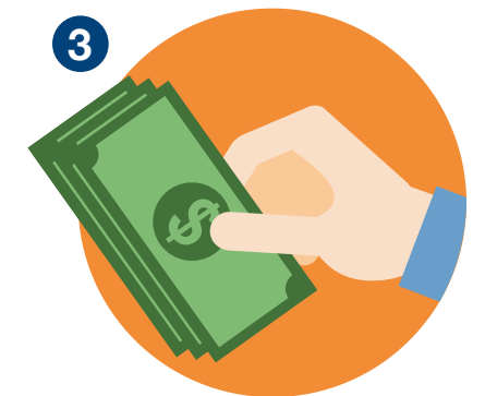
Post to payroll