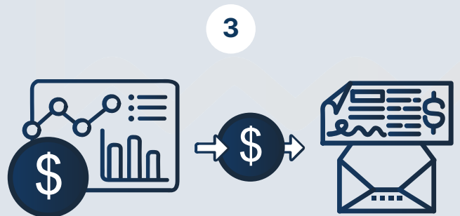
3 Post to Payroll

“ We have partnered with Evention and leveraged their solutions since 2006 to enable integrated reconciliation across gratuity payroll , cash journaling, and group billing. The Evention team listens to the needs of Hyatt and the industry to continuously enhance their automation to streamline compliance , ensure accuracy , and provide efficiencies across our operations.