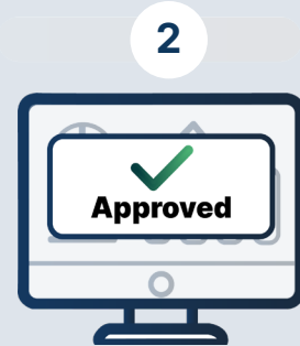
2 Automatic Gratuity Allocation and Distribution